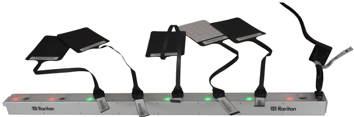
Feature ports support Raritan's electronic asset tagging to track assets in 1U rack increments.

FOR MORE DETAILS VISIT ANIXTER.COM/SHOPRARITAN