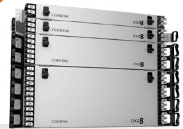
EDGE8 housings are available in 1U, 2U and 4U sizes featuring the same density as the EDGE HD housings.

Optimized harness mapping allows for 24-, 32-, 36- and 48-port blades on large chassis switches to be cabled with 8-fiber harnesses with no unused fiber or connectors.