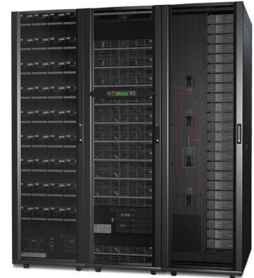
Modular, scalable 3-phase power protection.

APC by Schneider Electric's Symmetra PX is a world-class redundant and scalable power protection system designed to cost effectively provide high levels of availability. Seamlessly integrating into today's state-of-the-art data center designs, the Symmetra PX is a true modular system. Made up of dedicated and redundant modules—power, intelligence, battery and bypass—all engineered into a design that is easily and efficiently serviceable, this architecture can scale power and runtime as demand grows or as higher levels of availability are required.