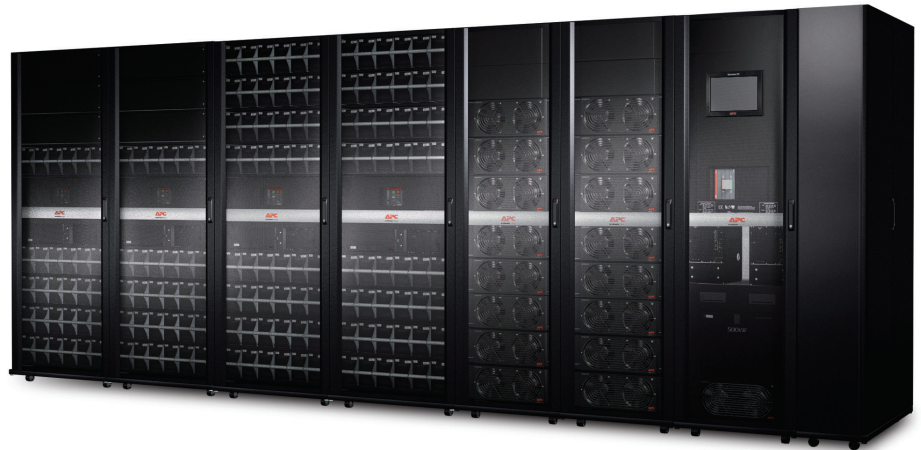
Models ranging from 20 - 500 kW.

> FOR MORE DETAILS VISIT ANIXTER.COM/SHOPAPC