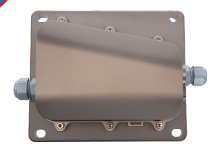
PoE extender and mounting plate