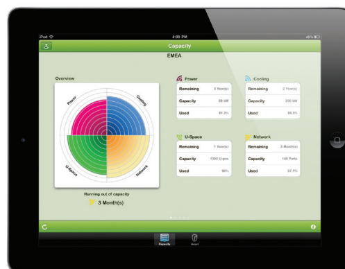
Overview of key data centre capacity displayed on a tablet.

> FOR MORE DETAILS VISIT ANIXTER.COM/SHOPAPC/EMEA