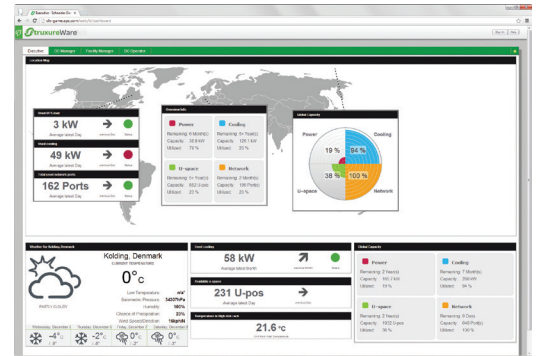
Live overview of data centre operations using widgets and data sets.

From managing complex IT networks to cutting enterprisewide energy and operating costs, you face daily data centre challenges. Now, get the most from your data centre and simplify operations with APC by Schneider Electric's StruxureWare for Data Centres software. It's an advanced data centre infrastructure management (DCIM) suite that gives you the end-to-end visibility you need to optimise, operate and manage your data centre from rack to row to room to building.