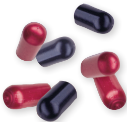
BE2MFT (red) and BE3MFT (black)