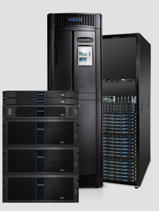
SHARED AND ARCHIVE STORAGE Scale-out file storage, object storage, tape, and cloud.