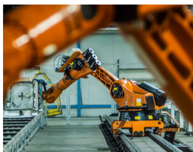
Industrial and Commercial Manufacturing