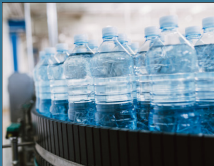
Food and Beverage

Molex has a range of standard and custom industrial solutions that meet the unique challenges of operating in rugged, wet or heavy-duty industrial environments. Leveraging applications in multiple industries provides an opportunity to promote our broad range of core and new products.