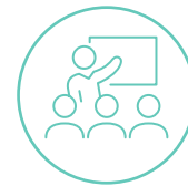
Learning Locker and Sales Tools

The Learning Locker includes product training modules, videos and sales presentations to equip our distributors to promote and sell our product ranges. Learning Locker owners also benefit from samples of selected new products and automatic registration into our newsletter and other regular communications.