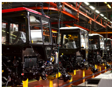
Commercial Vehicle Production