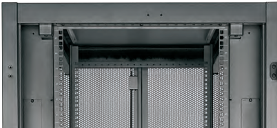
Integral vertical blanking panels in the 800mm wide cabinet offers 4 zero RU vertical openings that improve floor space utilization by up to 10%