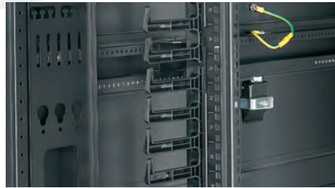
Cable Management Fingers and Mounting Brackets for 800mm Cabinet