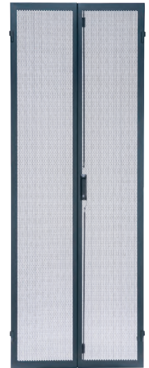
Split Rear Door