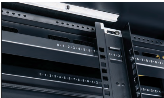
Fully adjustable equipment rails with easy to read horizontal markings offer application flexibility, allowing you to make a network or server cabinet.