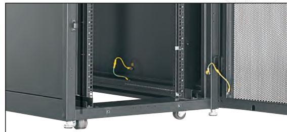
Bonded doors and side panels provide a complete bonded cabinet for protection of equipment and personnel