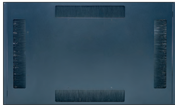
Large brush cable entry minimizes hot air recirculation and allows for large bundles of cables