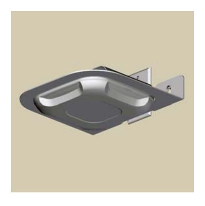
Right angle brackets customized for different vendors APs, mount the AP in the preferred