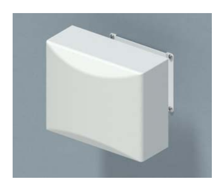
Antenna and AP articulating wall mount bracket with paintable vanity cover, facilitates zones of coverage in auditoriums and classrooms