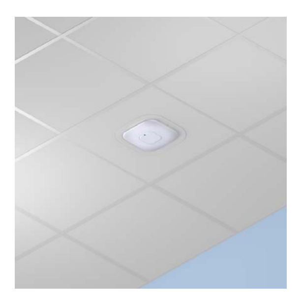
Cloud, Panel, and suspended ceiling recessed mounting kits, provides aesthetics and optimal wireless performance in most commercial building environments