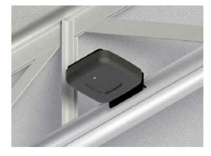
Right angle bracket with paintable AP vanity cover, conceals AP in open ceiling environments