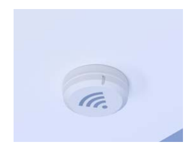
Non-metallic surface mount enclosures protect access points in challenging indoor and outdoor environments