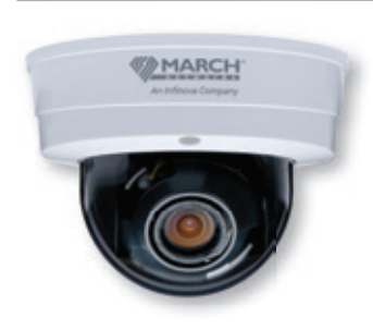
Calibrate the camera for analytics in less than 5 minutes!

Searchlight integrates with the MegaPX Indoor Analytics Dome from March Networks, the camera that performs the people counting, queue length monitoring, customer dwell time, and presence detection analytics. Searchlight incorporates these analytics with your store's transactional data, video, and alarms, so you can see more about your store, improve operations, and grow profits.