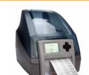
Thermal Transfer Printers