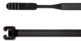
Open Head Q-Ties®