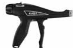
EVO 7 (for 18-80 lb. cables ties)

EVO® Series manual tools are designed to be the most ergonomic tools on the market.