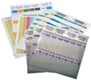
Laser Tags & Inkjet Labels

Designed for lasting performance in a variety of industrial settings, indoors and out, HellermannTyton labels, placards and nameplates help create efficient and safe environments by marking hazards, equipment and network components.