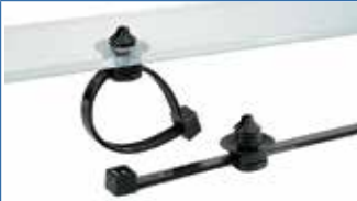
Cable Tie with Fir Tree Mount Assemblies