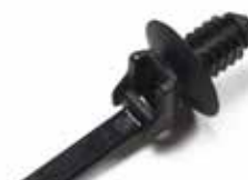
Cable Ties with Fir Tree Mounts