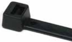
Standard Cable Ties

Available in specialized, high-performance materials, HellermannTyton cable ties come in a variety of sizes to accommodate wire and cable bundles in a range of applications. Choose from high heat and UV resistant nylons and stainless steel materials.