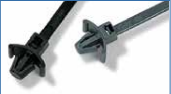
Arrowhead Mount Ties