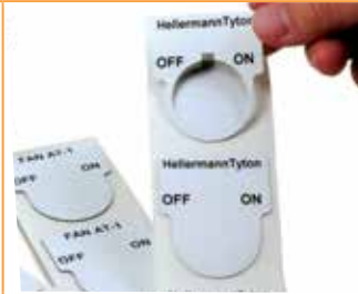
Foam and Plastic Nameplates