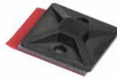
High-strength Adhesive Mounts

Mounting bases and cable tie mounts offer endless options to secure and route cable and wire bundles on a variety of surfaces.