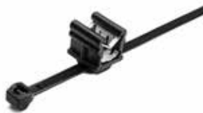
Edge Clip and Cable Tie Assemblies

Cable ties with an integrated mount offer fast and secure bundling. Choose from a wide variety of mounting styles, including edge clips, fir trees and button heads; for mounting to tubular frames and flat panels.