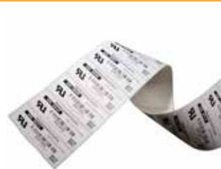
Thermal Transfer Labels

HellermannTyton thermal transfer printing systems, label design software and mobile apps enable easy, long-lasting labeling to help meet codes and standards.