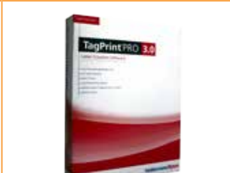
TagPrint® Pro 3.0 Software