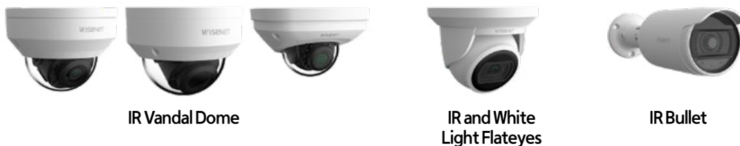
IR Vandal Dome