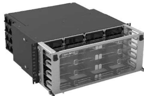
SYSTIMAX HD-4U sliding panel

And only CommScope is confident enough to guarantee support for your high-speed optic applications—including those you may want to run in the future! Your equipment may change every few years but, at CommScope, we're committed to ensuring your infrastructure remains scalable, manageable and agile enough to serve you over the long term. See CommScope SYSTIMAX Infrastructure System 25-year Extended Product Warranty and Application Assurance for details and conditions.