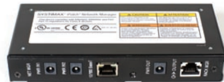
SYSTIMAX 360 iPatch Network Manager

With the iPatch Control System operating as a reporting system for your Intelligent Infrastructure Solutions, you gain the Vision and Knowledge you need to take Control of your network.