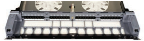
SYSTIMAX 360 iPatch G2 Fiber Shelf

iPatch intelligent fiber optic shelves provide unequalled Vision into changes in your physical layer infrastructure. This Vision is combined with Knowledge provided by iPatch System Manager software to deliver the Control you need to manage your network.