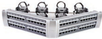
SYSTIMAX 360 iPatch Angled Evolve Patch Panel, 48 Port