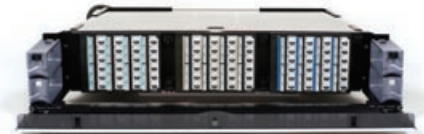
SYSTIMAX 360 iPatch G2 High Density Fiber Shelf