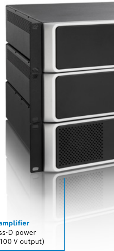
Two-channel amplifier 2 x 500 W class-D power amplifier (70/100 V output)