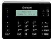
BOS-B921C Capacitive Touch Keypad