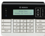
BOS-B920 Text w/Function Keys Keypad