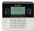
BOS-B930 Text w/Soft Keys Keypad