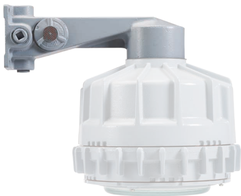
WALL BRACKET HOOD